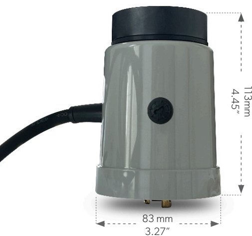
Westire DC Power Tap