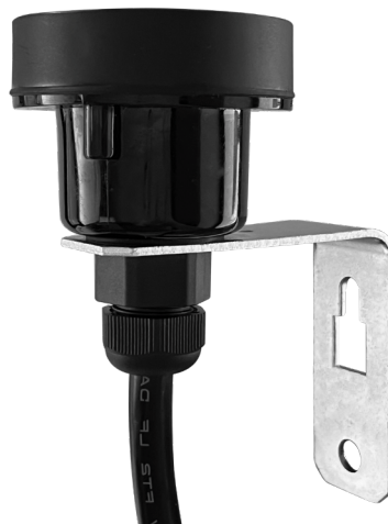
Westire ANSI/NEMA Socket & Bracket